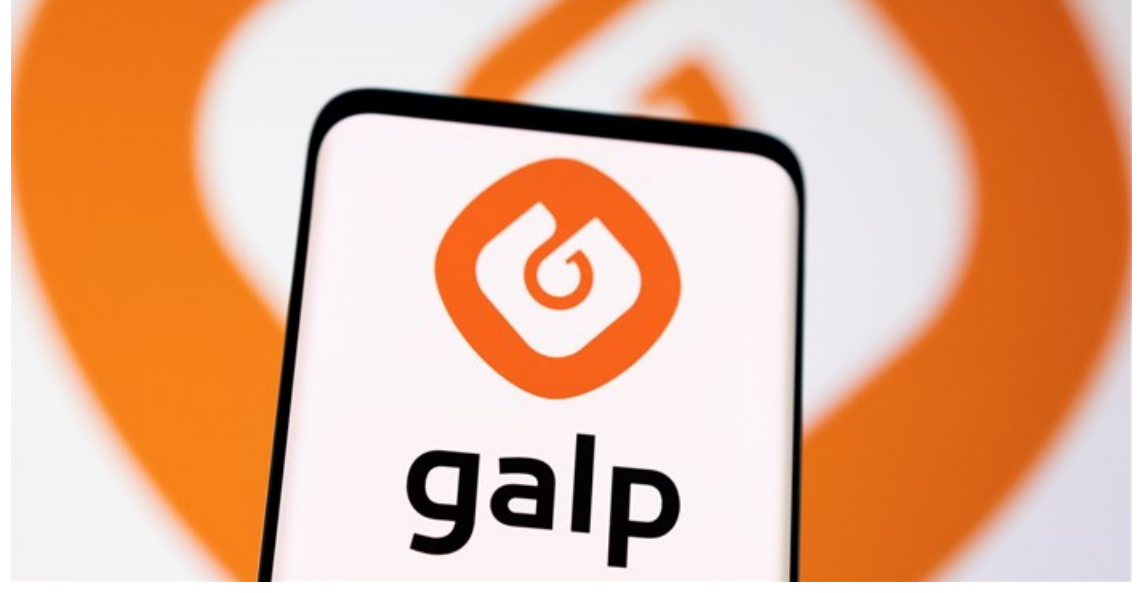
Galp Energia logo is seen displayed in this illustration taken.

Portuguese oil company Galp Energia said on Sunday it had concluded the first phase of exploration in the Mopane field off the coast of Namibia and estimated it could have at least 10 billion barrels of oil.