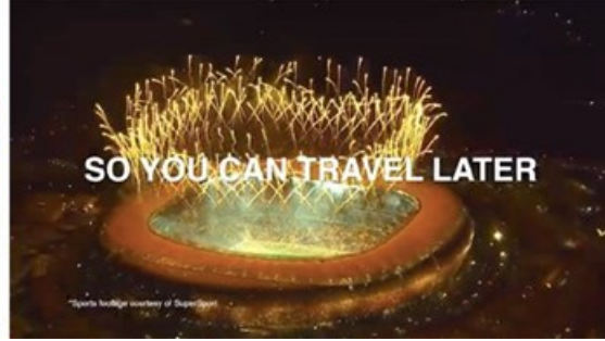
Team South Africa - Call Up

Directly, South African Tourism challenges the idea of a destination brand to communicate during a global travel ban - and still, ultimately, putting local culture, heritage and community at the heart of its message. By doing so it negates the preconceived notion of tourism as being reliant on external visitors, rather than thriving on local people, being locally appreciated.