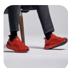
Khalanga, the new sneaker range from Bathu

"Local brands - Bathu from South Africa and SoleRebels from Ethiopia - are prime examples of this. As part of their differentiation strategy, both brands draw on cultural heritage. Authenticity has allowed these brands to carve out a niche in a market traditionally dominated by global brands."