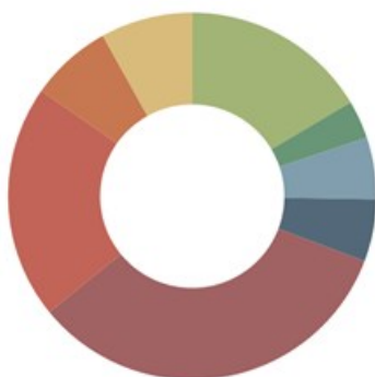
Projected mobile network operator revenue from A2P RCS traffic in 2025.

A2P messaging, which involves sending texts from a business-operated software application to a consumer's device, is emerging as a game-changer in the digital communication landscape.